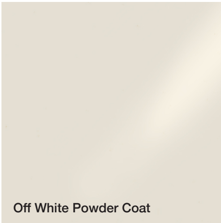
Off White Powder Coat