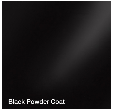
Black Powder Coat