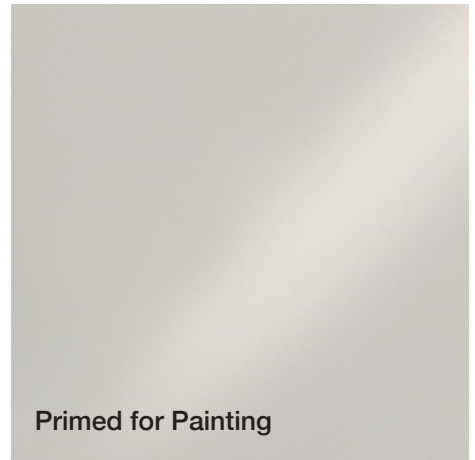
Primed for Painting