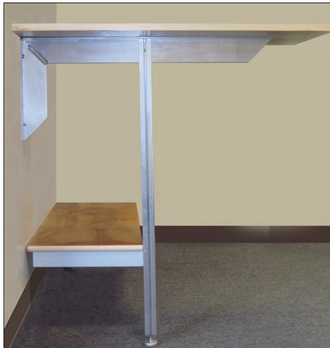
Shown with Optional Shelf